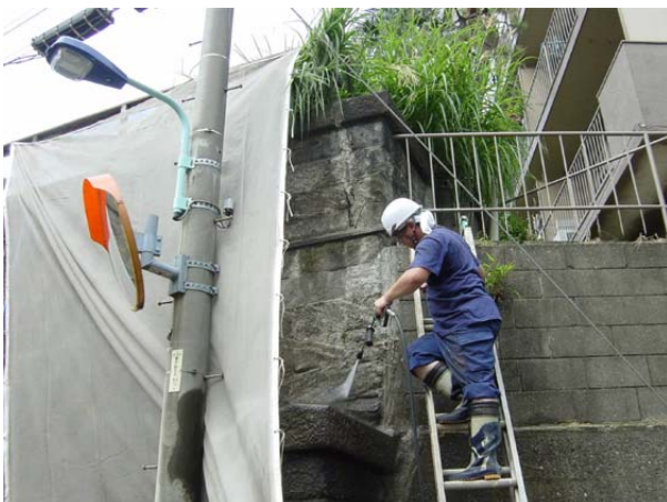
Before washing and the alga of a ground wall overgrow firmly.