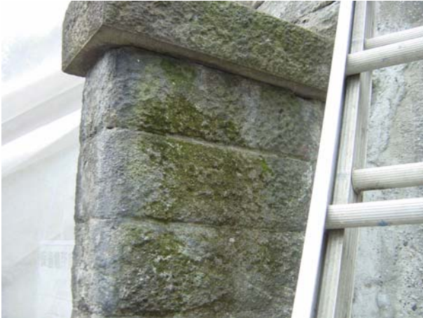
The dirt of pumice tuff which carried out many years past is conspicuous.