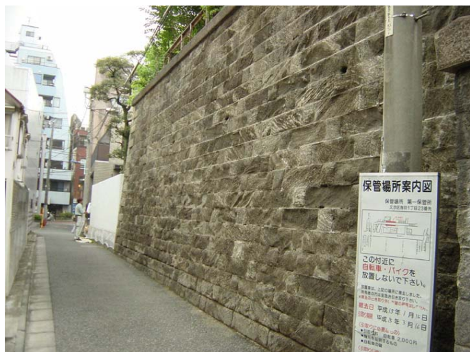
The completion of construction