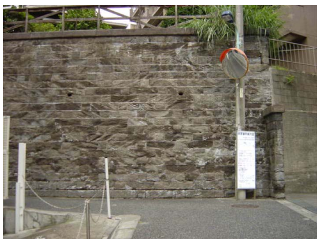
Completion of waterproofing protection.