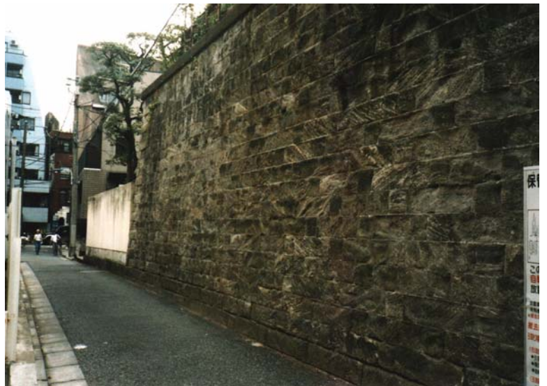
The dirt of pumice tuff which carried out many years past is conspicuous.