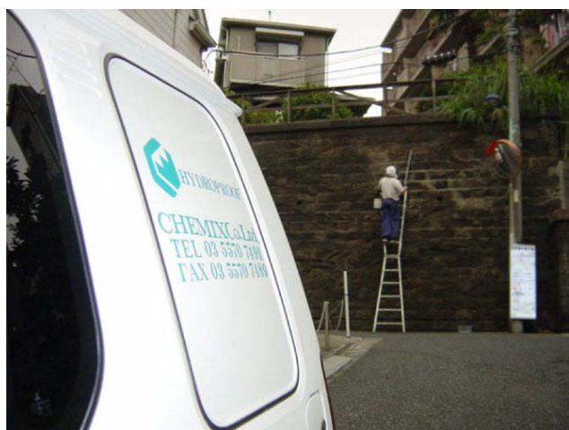
HYDROPROOF WP-MX application

Washing although it became beautiful next morning completely it still gets wet color and is not settled