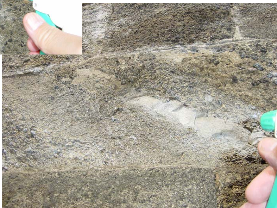
Water does not sink in.