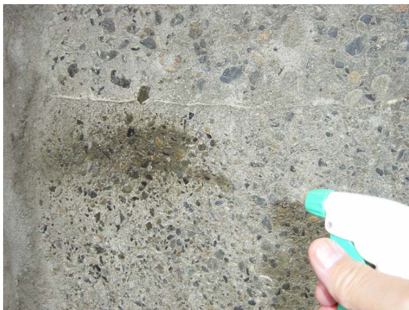
Water is poured on a non-constructed portion by the spray. Water is sucked in as seen.