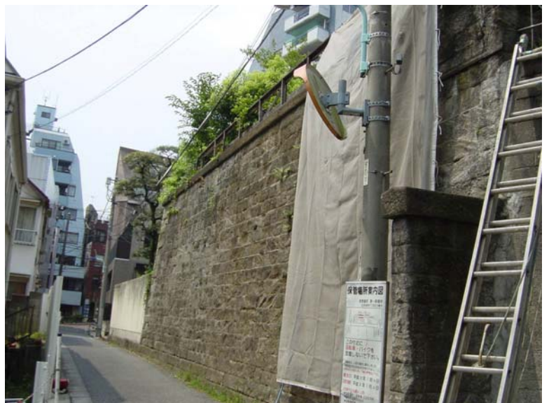
It is the take sheet care so that it may not disperse before washing and around ground wall.