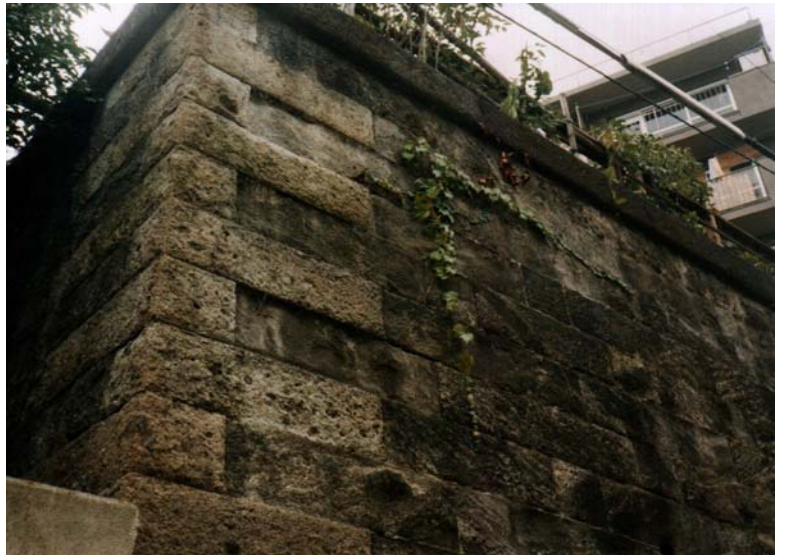
pumice tuff present condition and the root of an ivy, moss make the surface weak